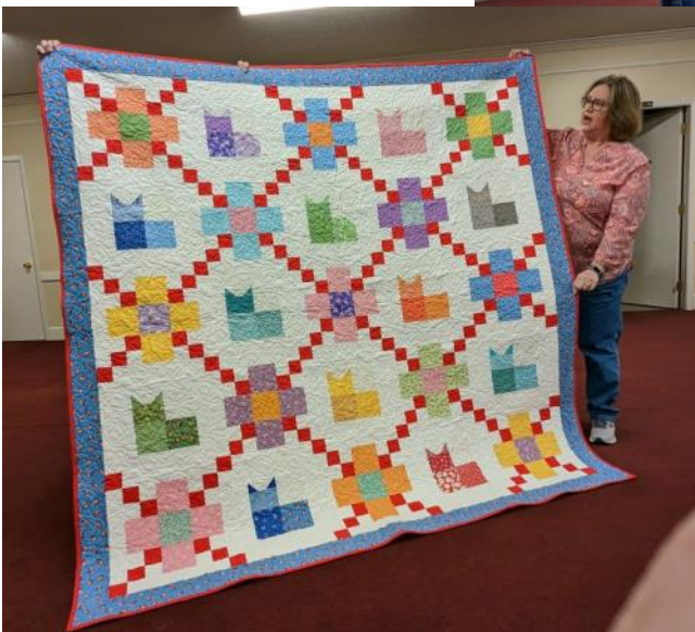
Ann McDonald—Calico Cats

Creative license allowed with colors and quilting motifs (ie blue can be aqua, stipple can be meander, etc.)